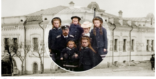
THE IPATIEV HOUSE IN YEKATERINBURG WHICH SERVED AS A PRISON FOR THE ROMANOV ROYAL FAMILY

09. "Without warning" and without leaving the period depicted in section 07, the vision narrates the martyrdom of Tsar Nicholas II. The angry and beastly souls of the persecutors are depicted by corresponding animals: "The wild beasts, the dogs and the scorpions trampled upon the king." Being a human, the king was also, without a doubt, a sinner. But he was anointed king in the name of the Super-essential Trinity; therefore the murder was not only a sin before people but first before God. This is why the prophet-king David, though he was loved by God, did not dare raise a hand against king Saul. And he said to him: "... the Lord delivered you this day into my hands, and I would not lift my hand against the Lord's anointed [king].<sup>8</sup>"